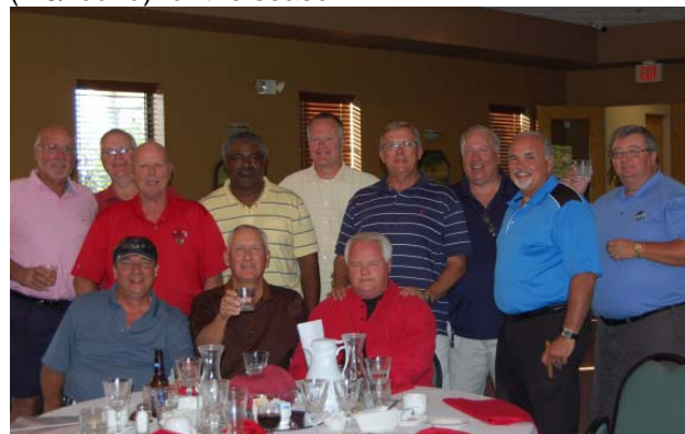
Some of the Osco EOW members