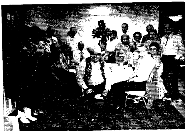
The "Shuffling Squares"

This past year, the Shuffling Squares have been asked to perform for different clubs and organizations. In fact, last December they put on a demonstration for Wally & Loretta Brodack's seniors club.