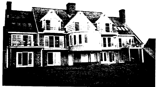
The Main House

balconies. The guest cottage adds 2 more bedrooms and 2 more full baths. This was living!